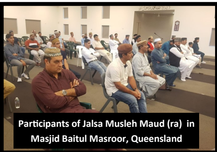
Participants of Jalsa Musleh Maud (ra) in Masjid Baitul Masroor, Queensland