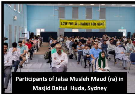
Participants of Jalsa Musleh Maud (ra) in Masjid Baitul Huda, Sydney