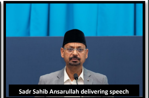
Sadr Sahib Ansarullah delivering speech